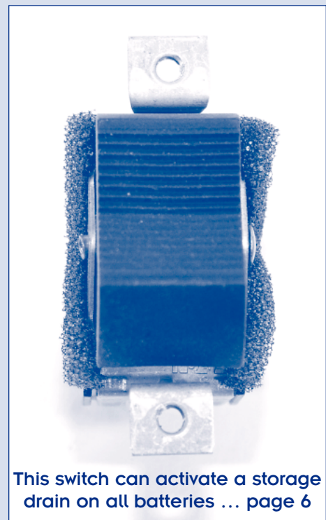
This switch can activate a storage drain on all batteries ... page 6