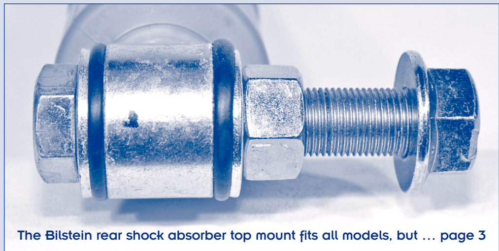
The Bilstein rear shock absorber top mount fits all models, but ... page 3